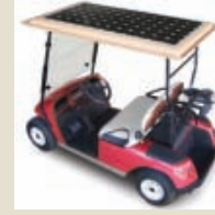
Solar Utility Cart