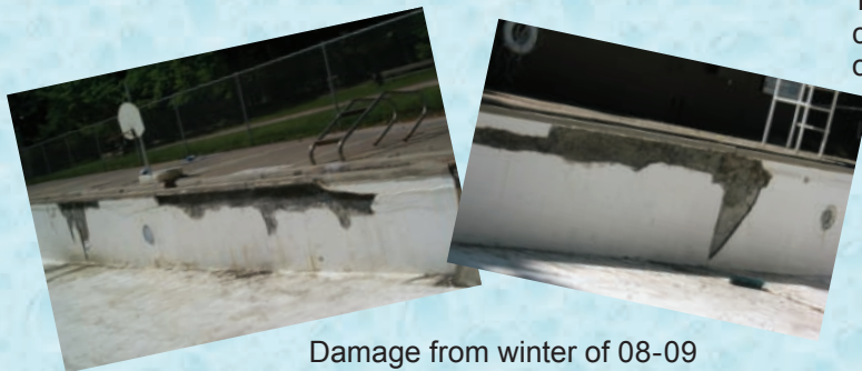
Damage from winter of 08-09

Currently, we are receiving several pool designs and proposals for a new pool. A pool task committee has been formed to make a recommendation to our Board of Trustees.